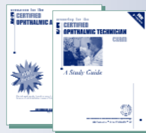
COA® Study Guide COT® Study Guide

Test Your Knowledge! Keep Your Certification Current!