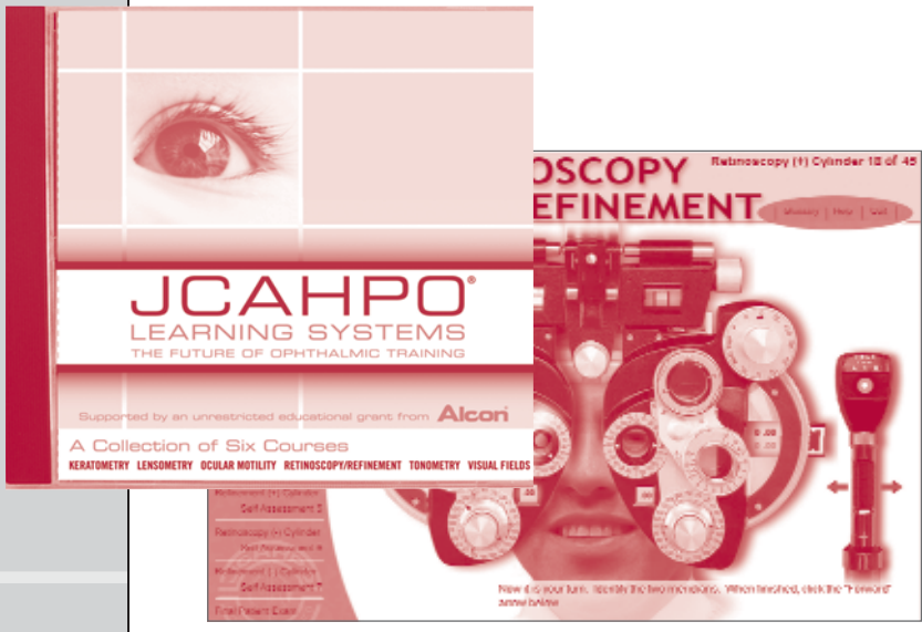
Interactive screen example

Endorsed by the International Medical Contact Lens Council (IMCLC) as a valuable training tool for ophthalmic professional staff.