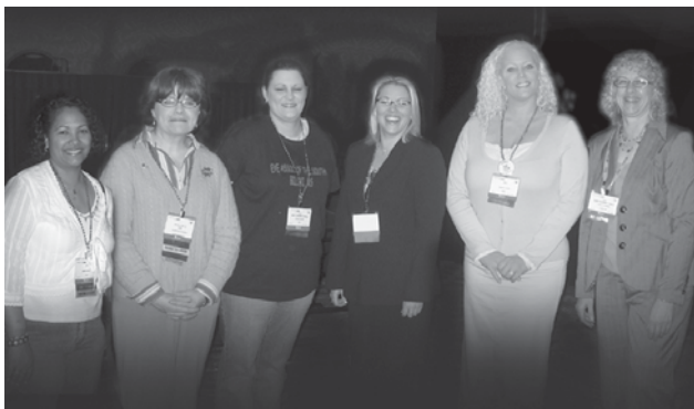
Some of the 2007 CE scholarship recipients