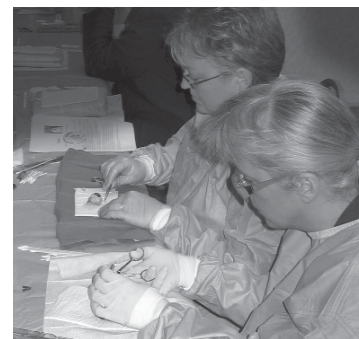
Introduction to Optical Coherence Tomography (OCT) Workshop